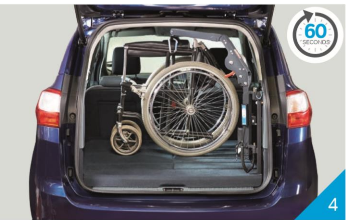
Your mobility device is safely stowed

With two lifting capacities, 40kgs and 80kgs the Mini Hoist is ideal for folding scooters and wheelchairs.