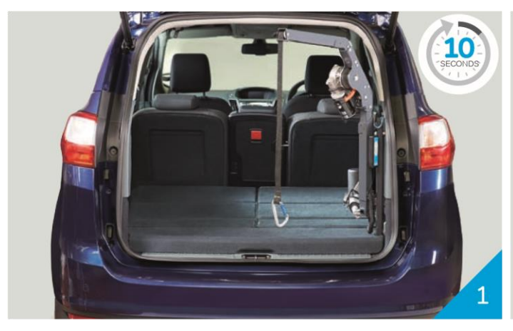
Pull down attachment strap