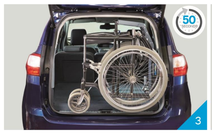
Press the button to begin hoisting