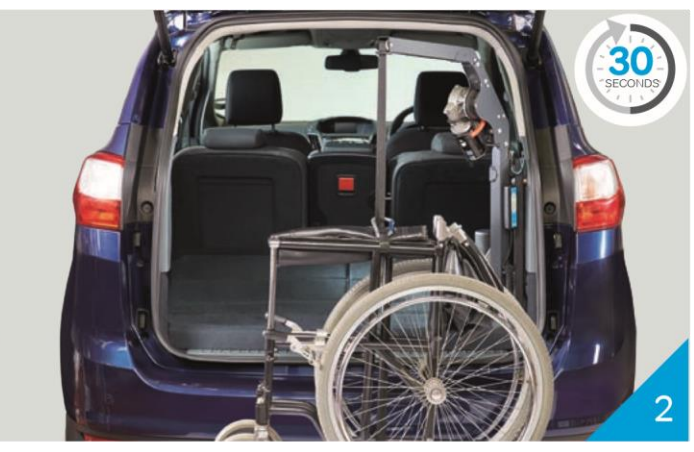
Attach mini scooter or wheelchair to attachment strap