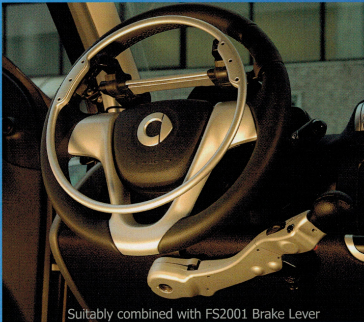
Suitably combined with FS2001 Brake Lever