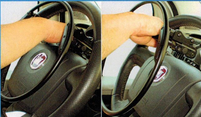
Quick release functionality