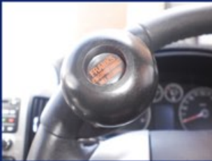
Arlow Spinner Knob

Push/Pull - Pull for acceleration & push for braking.