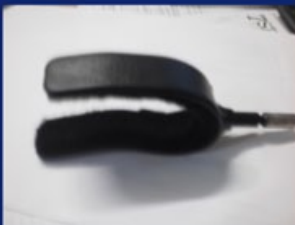
Quad Fork Spinner Knob