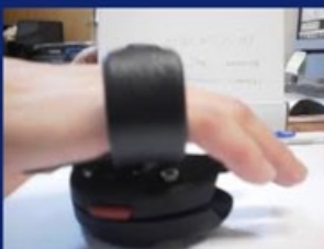
C Spinner Knob